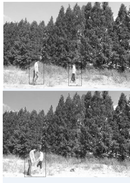
Fig. 3 Simulation result images

To verify proposed algorithm, 100 frames were simulated, and 95 of them were correct detection and 5 of them had false detection by performing 95% of correct detection rate. The some simulated results are shown in Fig. 3. Therefore, proposed algorithm can be used as an effective moving object detection algorithm since it has a high detection rate.