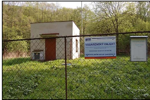
Fig. 3 Ježkovice RV12 drilled well and its surroundings

Note: Red circle shows the site of drilled well