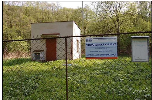
Fig. 3 Ježkovice RV12 drilled well and its surroundings

Note: Red circle shows the site of drilled well