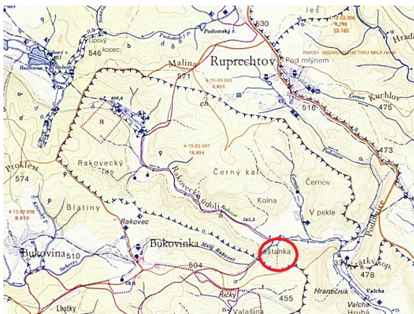
Fig. 2 Hydrological Map of the Area

Note: Red circle shows the site of drilled well