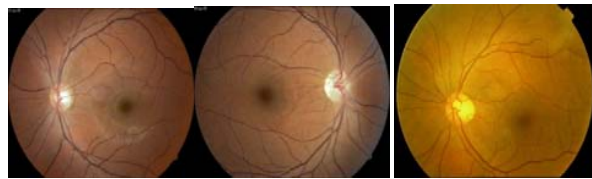
Fig. 3 Sample normal fundus images

Samples of these two categories of images are shown in Fig. 3 and Fig. 4.