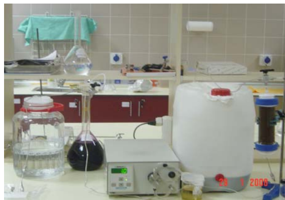
Fig. 2 1-D flow-cell experimental setup

The degradation of residual TCE located in the carbonate soil and at the regolith contact with travertine bedrock was examined by a set of flow-cell experiments. The oxidation of residual TCE in the carbonate soil was investigated by the 1-D column experiments. The column is glass made and has a dimension of 5 cm diameter and 15 cm in length (Fig. 2). The oxidation of residual TCE pooling at the regolith contact with travertine was investigated by a custom made stainless steel 2-D flow cell (12cm (H) x 27 cm (L) x 5 cm (W) (Fig. 3). Front side of the 2-D flow cell was covered by the Plexiglas material for visual examination of the oxidation reaction and the possible mobilization of TCE mass. A known amount of TCE mass was injected into the soil and the pools located above the travertine. After providing sufficient time for the dispersion of TCE, flow cell was flushed by potassium permanganate either as a pulse or continuous input. Non-reactive tracer tests were also conducted prior and after the oxidation process to determine the influence of oxidation on flow conditions. During experiments, effluent samples were collected periodically and analyzed for Cl, pH, MnO_4 and TCE. Breakthrough curves obtained from the flow-cell experiments were analyzed using methods of moments for determining the amount of TCE mass destroyed.