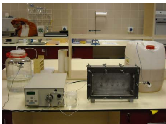
Fig. 3 2-D flow-cell experimental setup