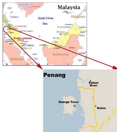
Fig. 1 Study area

The study area is the Penang Island, Malaysia, located within latitudes 5^{\circ} 12' \text{ N} to 5^{\circ} 30' \text{ N} and longitudes 100^{\circ} 09' \text{ E} to 100^{\circ} 26' \text{ E} . The corresponding satellite track for the TM scenes is 128/56. The map of the region is shown in Figure 1. The satellite images were acquired on 5-2-2003, 6-3-02, 15-2-01, 19-3-04 and 17-1-02. The corresponding PM10 measurements were collected simultaneously during the satellite overpasses.