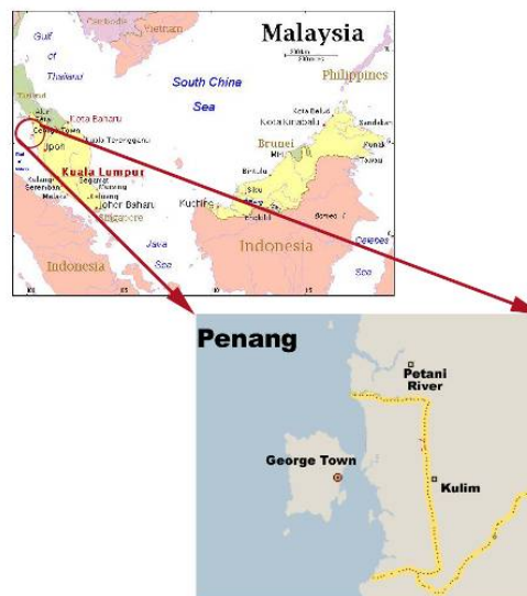
Fig. 1 Study area

The study area is the Penang Island, Malaysia, located within latitudes 5^{\circ} 12' \text{ N} to 5^{\circ} 30' \text{ N} and longitudes 100^{\circ} 09' \text{ E} to 100^{\circ} 26' \text{ E} . The corresponding satellite track for the TM scenes is 128/56. The map of the region is shown in Figure 1. The satellite images were acquired on 5-2-2003, 6-3-02, 15-2-01, 19-3-04 and 17-1-02. The corresponding PM10 measurements were collected simultaneously during the satellite overpasses.