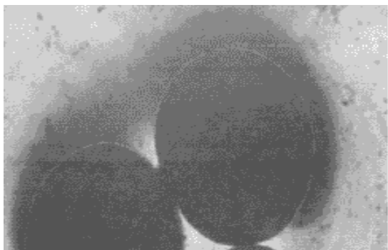
Fig. 2 (a): Microphotograph of DFS and EC Microcapsules (F2)