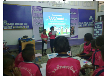
Fig. 6 Reporting Activities Result