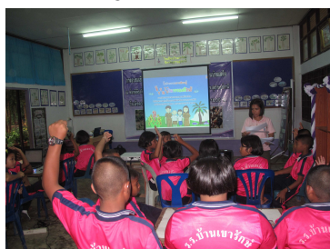
Fig. 1 Orientation