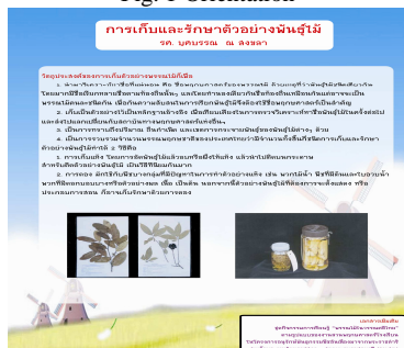
Fig. 2 Online Learning Lessons