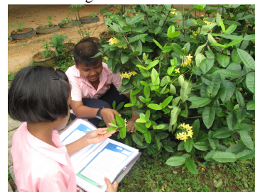
Fig. 5 Students in creating botanical garden