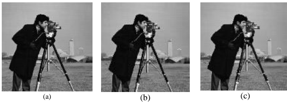
Fig. 3 Reconstructed images of Cameraman by (a) proposed method with fuzzy logical bit block (b) conventional BTC (c) ABTC with 16 predefined bit planes.