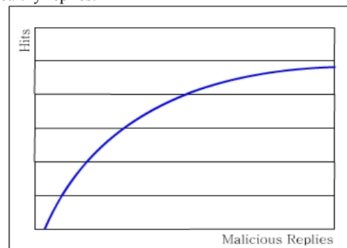
Fig. 1 Diminishing Marginal Utility of Malicious Reply

On the other hand, for healthy replies, marginal utility increases. Malicious replies tend to repel readers, but healthy replies tend to attract more readers to visit the board. Thus, equilibrium forms between the marginal utilities of malicious and healthy replies.