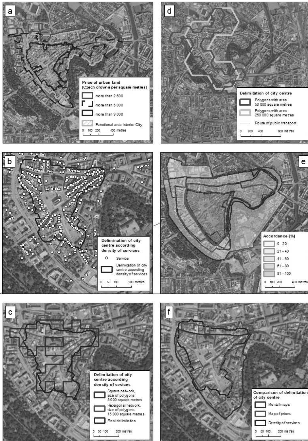
Fig. 2 Suggested delimitations of the city center