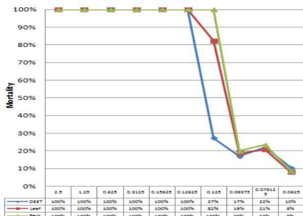
Fig. 1 Results for acaricidal effects