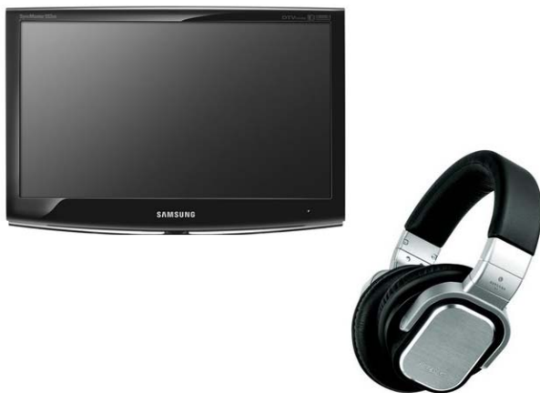
Fig. 1 A 19-inch television and headphone using in this study

function of the television was off. In the visual condition, we used subtitles for dialogue of the video. The content was identical to that of the audio of e-learning video.