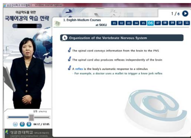
Fig. 3 A screen shot of online classes in open courseware systems of the university

Six indexes were measured in this study. Four constructs composed of 16 items, content credibility ( \alpha = 0.87 ), liking ( \alpha = 0.79 ), quality ( \alpha = 0.91 ), and representativeness ( \alpha = 0.81 ) of the content perceptions, were adapted from studies of Sundar and his colleagues [8, 10]. Attitude toward e-learning contents ( \alpha = 0.84 ) was an index composed of three items previously used by a study of Park and his colleagues [11, 12, 13, 14, 15]. Perceived suitability for delivering information ( \alpha = 0.84 ) was an index of three items adapted by a study of Haslam and Ryan [16]. The participants answered all items by marking on a 7-point Likert scale (1="strongly disagree" ~ 7="strongly agree").