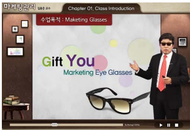
Fig. 4 One of the six videos using in this study

the modality conditions found that the students in the auditory-visual condition ( M=5.93 , SD=0.63 ) reported a higher degree of content quality than those in the auditory ( M=4.00 , SD=1.30 ) and visual conditions ( M=5.05 , SD=1.10 ), F(2, 57)=17.103 , p<0.001 . The students in the visual condition ( M=6.11 , SD=0.74 ) indicated significantly a higher degree of content representativeness than those in the auditory-visual ( M=5.38 , SD=0.98 ) and auditory conditions ( M=4.06 , SD=0.64 ), F(2, 57)=33.983 . In addition, the students in the auditory condition ( M=3.94 , SD=0.50 ) reported a lower degree of perceived suitability for delivering information than those in the auditory-visual ( M=5.45 , SD=0.73 ) and visual conditions ( M=5.34 , SD=0.76 ), F(2, 57)=31.307 . However, the communication modality did not have notable effects on attitude ( p=0.93 ) and content liking ( p=0.53 ) (Figure 5).