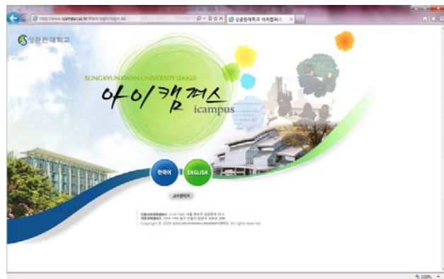
Fig. 2 A main home-page of open courseware systems in the university

After the time for watching and listening was over, all participants were asked to answer questionnaire items including degrees of content perceptions, attitudes toward e-learning contents, and perceived suitability for delivering information. Then, all participants were thanked and received about 3 USD.