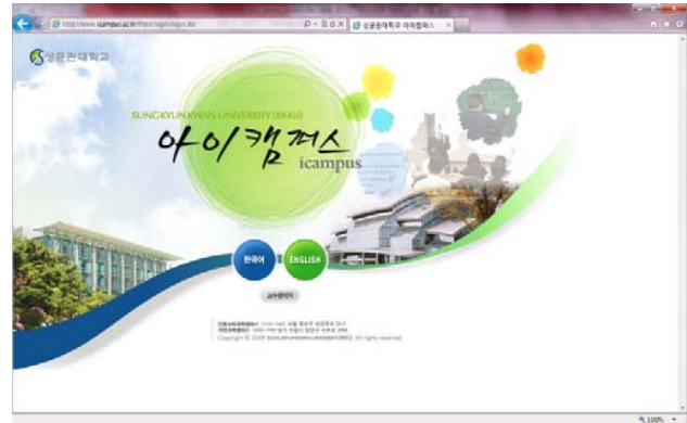
Fig. 2 A main home-page of open courseware systems in the university

After the time for watching and listening was over, all participants were asked to answer questionnaire items including degrees of content perceptions, attitudes toward e-learning contents, and perceived suitability for delivering information. Then, all participants were thanked and received about 3 USD.