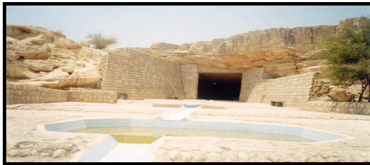
Fig. 11 Advane Cave