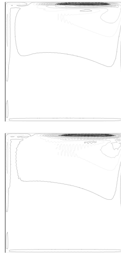
Fig. 1. Similarity of SEM (top) and FFD (bottom) at T = 0.1 with \chi = 0.5 , h = 1/36

Sensitivity of the time relaxation model to the time relaxation coefficient \chi on a two dimensional cavity problem was computed via SEM and FFD methods. The numerical comparison between the methods shows that the sensitivity is the highest about \chi = 1 . Also, on a coarser mesh we can see that the sensitivity becomes larger than on the finer mesh, which agrees with the assumption that we need finer mesh for sensitivity computations [2]. Also, sensitivity is higher for larger Re based on our obtained results. Overall, based on