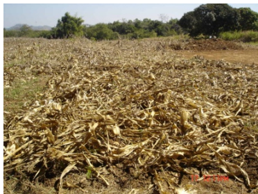
Fig. 4 Biomass prepared for open burning

A prescribed burn experiment was conducted at the corn field. Area of the prescribed burn was 7 \text{ m} \times 8 \text{ m} . The burning was prepared and conducted by traditional way of farmer (Fig. 4- Fig. 5). Farmer prepared the biomass by bending the residues down and igniting the fire at an upwind point. The measurement was conducted to monitor BC concentration in the ambient air by measuring before burning and monitor emission during burning by measuring in the plume. The black carbon concentration was measured real-time by Micro Aethalometer (model AE51, Magee Scientific, USA) at flow rate 5 ml/min. The emission of BC concentration from open burning of corn residues was measured by installing the Micro Aethalometer at 1 m height ground level downwind and moving to keep inlet of the instruments in the plume all the time.