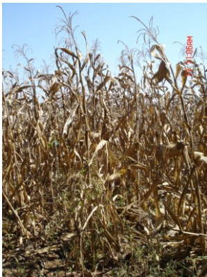
Fig. 2 Biomass remained in the field

\text{g}_{\text{dm}}/\text{m}^2 ). The collected samples were used as a fuel for simulating open burning experiment in the chamber.