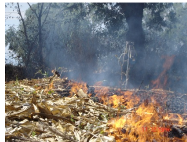
Fig. 5 Open burning of corn residues in the field

After finish burning, ash and unburned residues were collected back and analyzed for moisture content at the laboratory to consider dry mass for calculating combustion efficiency.