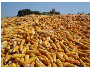
Fig. 3 Biomass moved out of the field