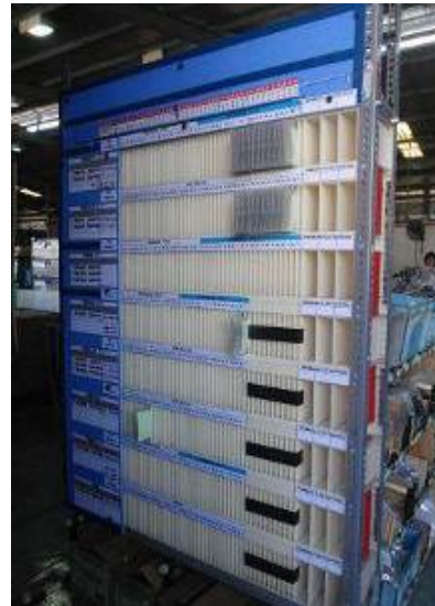
Fig. 9 Heijunka Post

In step 1.1, the sales speed is transferred to the production lines by using the PW kanban. The PW kanban represents the order of production to the lines according to what that has been sold to the customer. In this study, a heijunka post (Fig. 9) is used to level the production so that the big island cell produces the 4 models alternately with respect to customer demand.