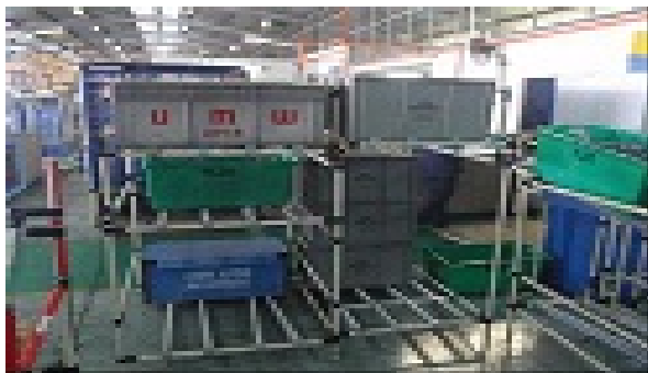
Fig. 8 Line Store

In step 1.0, a line store is placed at the big island cell. The line store is used to keep a calculated amount of FG stock to realize the supermarket pull to the warehouse according to the customer demand. Fig. 8 shows a picture of the line store.