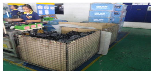
Fig. 3 Wire mesh

3) The cells use wire mesh (Fig. 3) as component supply. This leads to big production lot size of the models and creates too many WIP stocks (Fig. 4). It also utilizes more space.