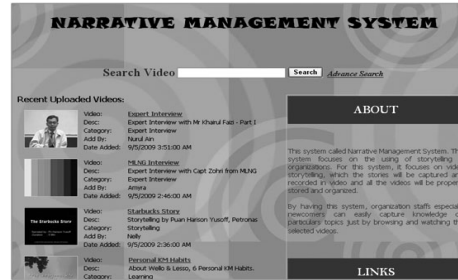
Fig. 3 NMS Main Page

Fig. 3 shows screenshot of the main page play video page.