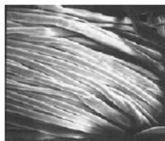
Fig. 1 Scanning electron microscopy no treatment