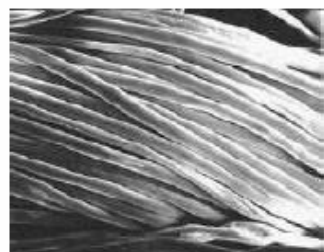
Fig. 2 Scanning electron microscopy of Ammonyx with treatment