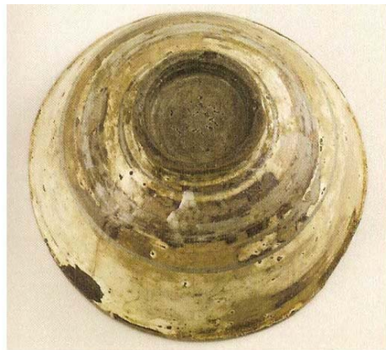
Fig. 4 Mashima(三島)Dawan(茶碗).Akira tani, Shin Ha-gyun. Aura Publishing. Bowl. 2009. p62. [9]