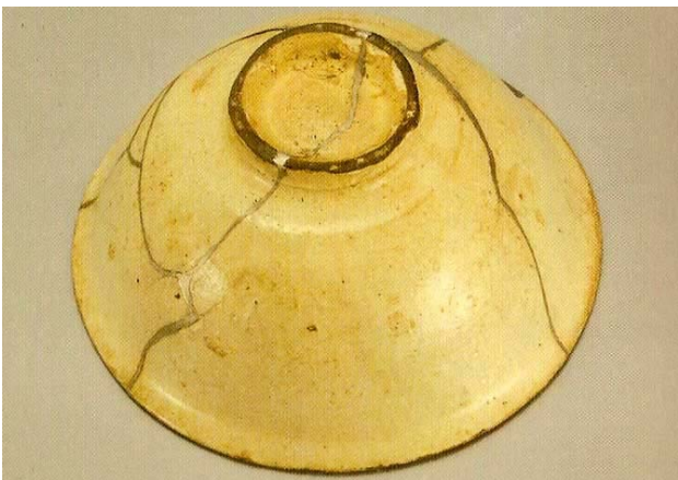
Fig. 6 Kohiki(粉吹)Dawan(茶碗).Akira tani, Shin Ha-gyun. Aura Publishing. Bowl. 2009.p64. [11]