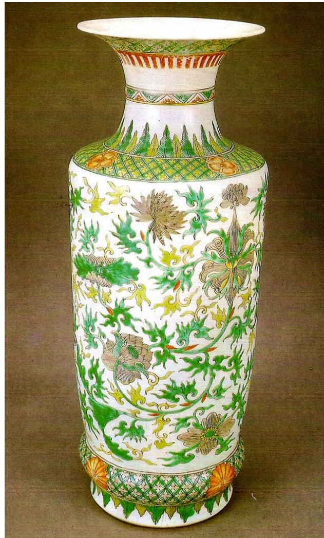
Fig. 3 China's Five colors(五彩). Yong-wook Lee. Chinese ceramic history.Mijinsa. 1993. p357 [8]

The colors that are manifested through China's five colors are blue, brown, red, white and black. In addition, there are diverse set of colors besides the elegant colors. In addition to the five colors, there is the golden color as well. Moreover, five colors are used for the porcelains' patterns while the entire porcelains can be painted with five colors. The colors that are often seen in the China's five colors are PANTONE 19-4053, PANTONE 14-0836, PANTONE 17-1558, PANTONE 12-0000, PANTONE 14-0957, PANTONE19-4203, PANTONE 16-0836 and PANTONE19-1015.