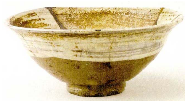
Fig. 5 Hakame(刷毛目)Dawan(茶碗).Akira tani, Shin Ha-gyun. Aura Publishing. Bowl. 2009.p66. [10]