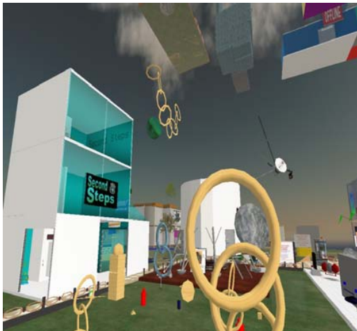
Fig. 2 Schome Park's area for carrying out physics experiments.