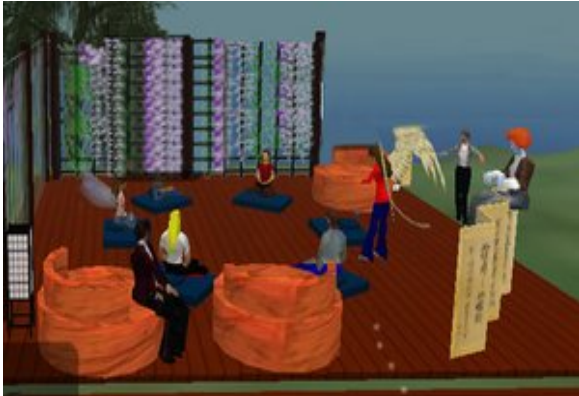
Fig. 1 Avatars in a 3D space engaged in a philosophy and ethics discussion.

worlds support the creation of constructivist learning environments ; [8], [10]. Research into purely text-based virtual worlds has found they too can 'promote an interactive style of learning, opportunities for collaboration, and meaningful engagement across time and space, both within and across classrooms' [11]. Visual representations of 'in-world' activities supply have additional affordances which support a constructivist paradigm of learning and 'highly cooperative learning activities' [6].