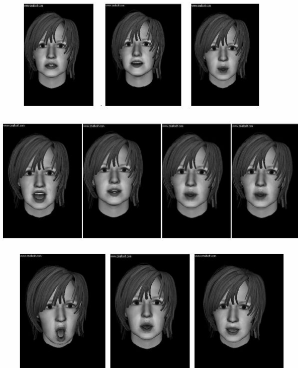
Fig. 2 Examples of 3D Slovak speech visemas

The goal of our work is to develop such sophisticated tool, which will be providing the regular Slovak speaking head. We are testing the Slovak visemes in Lip-reading method for Slovak deaf people. Currently we try to include them to the Total communication method. Lip-reading together with Sign language could be help the Slovak deaf people. The most popular systems used to transfer visual information for distance training for hearing-impaired people via Internet, which is based on the video compression standards H.261 and MPEG-4. In this case, the basic information is represented with video sequences, containing the image of the Sign Language interpreter [1].