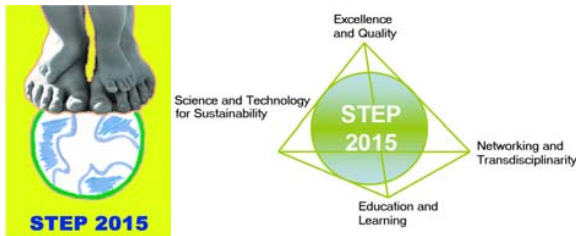
Fig. 1 STEP logo and key values for the Program

lessons learnt in the pilot experience (2011-12 and 2012-13). Fourth, the program is going to be applied to all UPC Schools and departments (2013-14 and 2014-15). Fig. 1 shows the logo that STEP program has been using in the promotion plan and even some merchandising has been created with it (pens, T-shirts...) together with some brochures containing information (Fig. 2) for advertising the plan among students and faculty. The key values that STEP program want to promote are reflected in Fig. 1 (right).