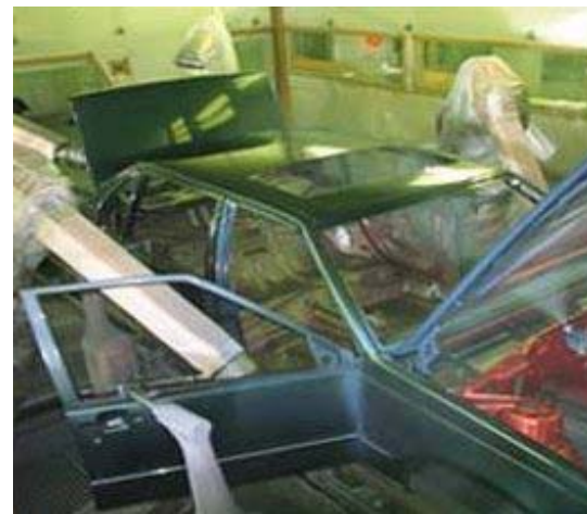
Fig. 5 Robotics processes in automobile production