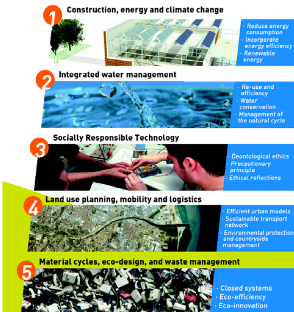
Fig. 2 UPC Sustainable 2015 Plan Challenges

This paper presents the STEP program, its implementation, development and evaluation highlighting the process recommendations to export the program to other Universities. Specifically the full process will be explained and the results up to the third phase will be shown, where the collected experience already covers ten technological schools of UPC (over 16 schools). This third phase has been the most exciting and creative one and for this reason authors want to share the enriching experience, the fourth phase (which is just beginning this academic year) will consist in enlarging and replicating the third phase. In this period, the basis of a methodological set-up has been developed preparing formative courses for lecturers in Education for the Sustainability in order the faculty are able to