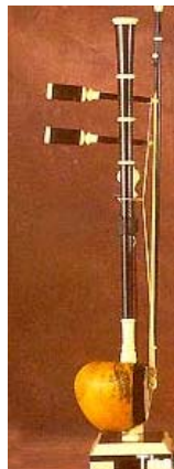
Fig. 11 Saw U http://www.thaitambon.com/tambon/tsmepdesc.[7]