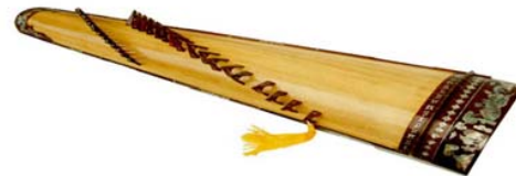
Fig. 5 Tranh zither- 16 strings Troung Ngoc Thang : Traditional Musical Instrument of Viet Ethnic Group [5]

Plucked strings of Vietnamese musical instruments, such as, Tranh zither- 16 strings, Moon-Shaped Lute or Dan Nguyet, Dan Day, Dan Bau, Dan Tam, Dan Ty Ba, etc.