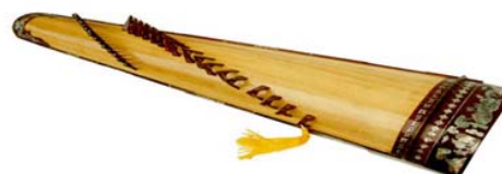
Fig. 5 Tranh zither- 16 strings Troung Ngoc Thang : Traditional Musical Instrument of Viet Ethnic Group [5]

Plucked strings of Vietnamese musical instruments, such as, Tranh zither- 16 strings, Moon-Shaped Lute or Dan Nguyet, Dan Day, Dan Bau, Dan Tam, Dan Ty Ba, etc.