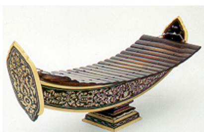
Fig. 3 Ranat Ayk

Third, Thai percussion instruments consist of Ranat Ayk, Ranat Thum, Ching, Chap, Hhawng Wong Yai, Hhawng Wong Lek, Glawng That, Taphon, Thon, Rammana, Glawng Khaek, Sawng Na.