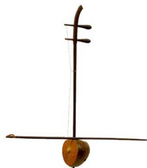
Fig. 12 Dan Gao Troung Ngoc Thang Traditional Musical Instrument of Viet Ethnic Group