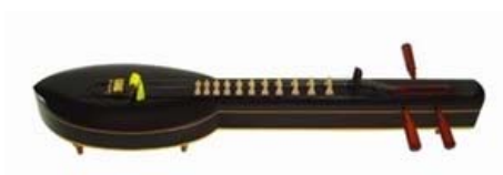
Fig. 1 Jakhay http://www.webpostthai.com/ [1]

There are many kinds of Thai musical instruments, first, plucked strings instruments, such as, Jakhay, Krajappi, Phin, Serng.