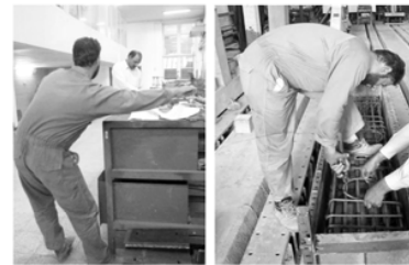
Code: 4232 AC: 3