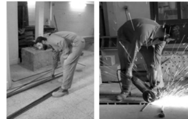
Code: 2152 AC: 3