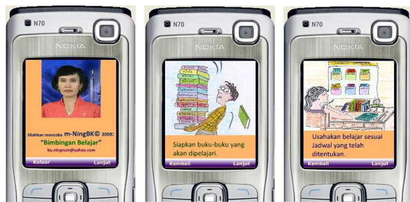
Fig. 2 Content services on the application of m-NingBK ©: "Learning Guidance"

ICT applications content that have been developed as shown by Table I.