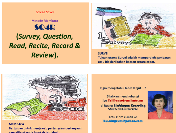
Fig. 3. Some displays of Screensaver "Learning Guidance"