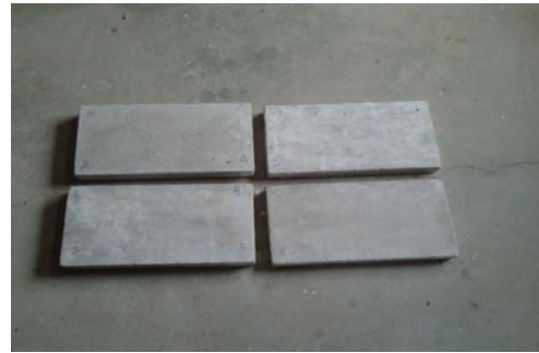
Fig. 3 Sisal fibre-reinforced 4 Concrete slabs