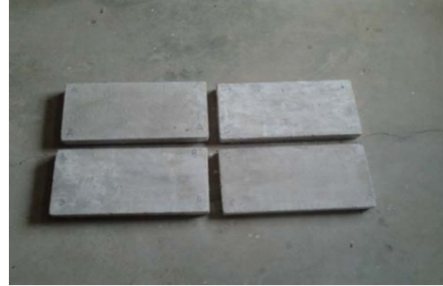
Fig. 3 Sisal fibre-reinforced 4 Concrete slabs