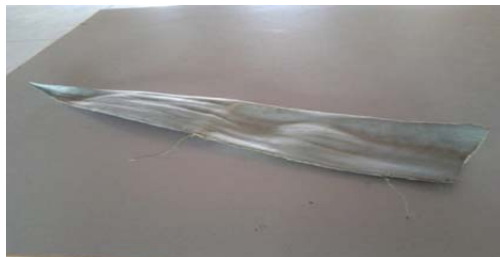
Fig. 1 Fresh Sisal leaf