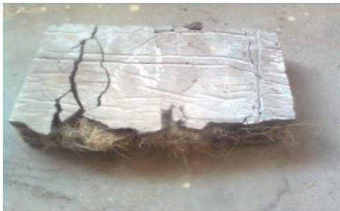
Fig. 5 Sisal fibre reinforced tested slab (3% fibre)