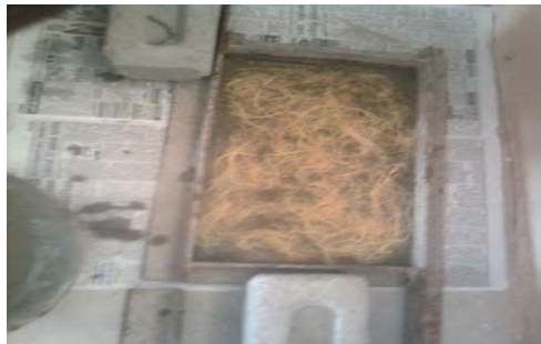
Fig. 2 Hand lay up concrete slab with sisal fibre