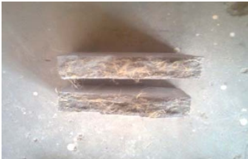
Fig. 4 Sisal fibre reinforced tested slabs (1% fibre)