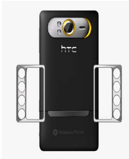
Fig. 4 Shows the back side of the mobile with flips outward

The provided flips for grip not only provides a better handling but also to be used as a stand for making the mobile sit in front of the user. See the following image for better understanding.