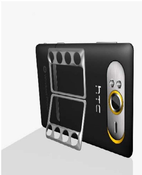
Fig. 5 Shows the use of flips as a mobile stand

The provided flips for grip not only provides a better handling but also to be used as a stand for making the mobile sit in front of the user. See the following image for better understanding.