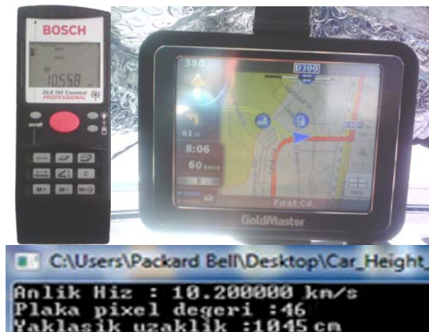
Fig. 3 Second Application of increasing speed