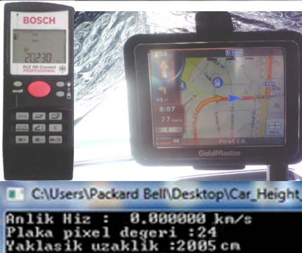
Fig. 4 First application of slow down speed