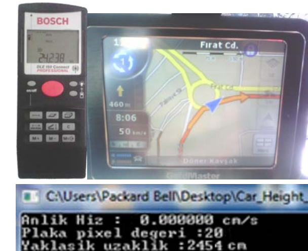
Fig. 2 First Application of increasing speed