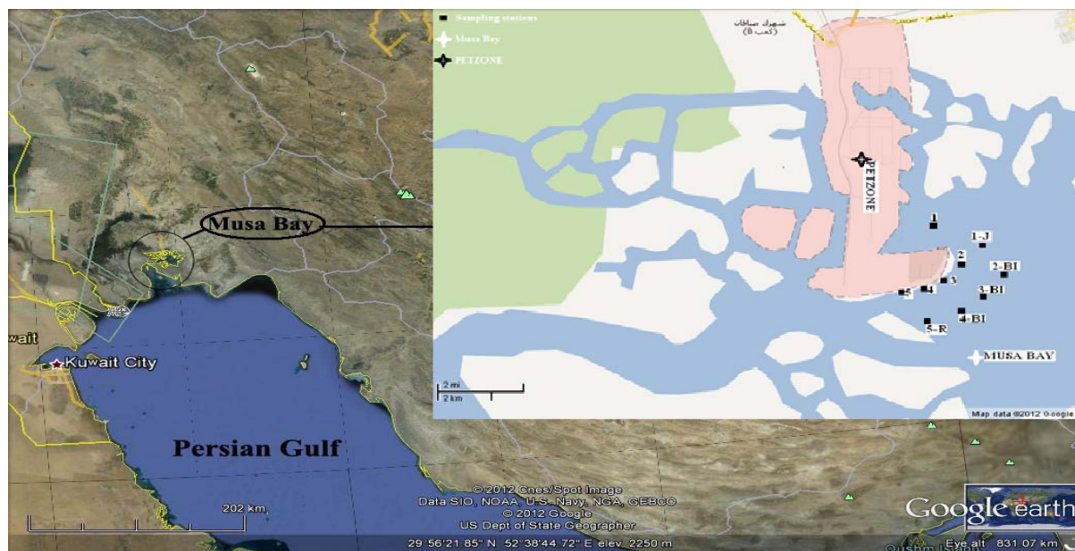
Fig. 1 Sampling stations in the Musa Bay

The PELq factor is the average of the ratios between the concentration of these parameters the sediment sample and the related PEL value [23, 24]. This factor describes contamination effect on biological organisms in sediment which range as non-adverse effect ( PELq < 0.1 ), slightly adverse effect ( 0.1 < PELq < 0.5 ), moderately adverse effect ( 0.5 < PELq < 1.5 ) and heavily adverse effect ( PELq > 1.5 ) [25].