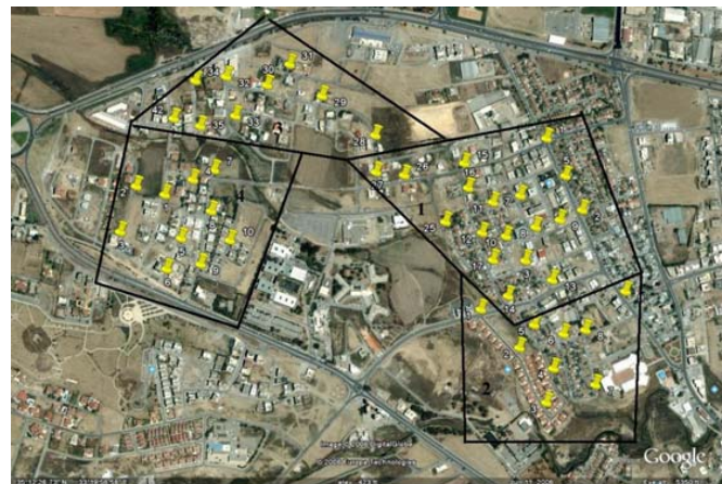
Fig. 2 Divided districts of Nicosia Municipality

The present system could be viewed as a network with undirected arcs and nodes. Every arc has a weight attached to it, and it is often possible to get from one node to another in more than one ways. Thus, if there are n nodes in a network, there must be at least n-1 arcs that are needed to connect all the nodes with one another. The basic algorithm that will be used over here is as follows: