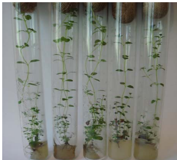
Fig. 1 Micro-plants of T. serpyllum L. on 1/2MS medium containing 0.1mg/l IBA

For further in vitro micro-propagation the explants of 0.4-0.5cm length were planted in 1/2MS medium containing 0.1 mg/l IBA. Root formation was recorded after 7-10 days. Micro-plants were obtained after 28-30 days, multiplication factor of which was 1:5. During the obtainment of the initial plants, the clonal micro-propagation method with activation of axillary buds was used, which was based on the removal of apical domination. The selected test tube plants were further propagated by micro-cuttings. The subculturing was done again in MS medium supplimented with 0.1mg/l IBA. It was found out that the micro-propagation of test tube plants in in vitro culture can be held throughout the year. But the best period is from spring to autumn. After 7-10 days rhizogenesis of explants was 98-99%. The length of micro-plants was 7-8cm after 28-30 days and the multiplication factor from one micro-plant was 1:6 (Fig 1).