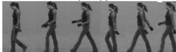
Fig. 2 Sample images from multiple frames of a single person's walking sequence [2]