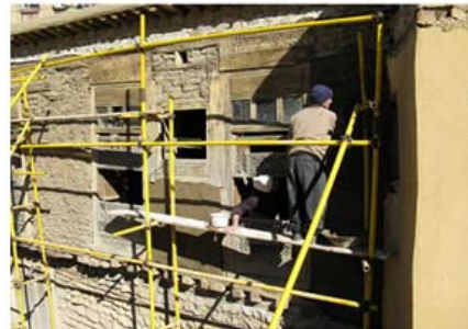
Fig. 9 Ingredients of wall in Masouleh houses