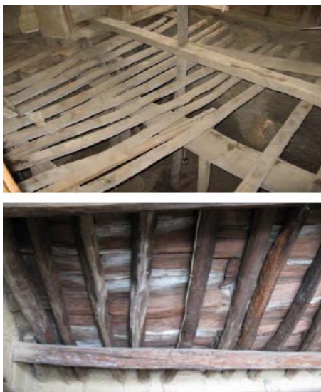
Fig. 11 The structure of roof at first until the end

against water. Also Fal- gel is a common plaster which is mixture of clay, shattered rice stalk and water; shattered rice stalk should not be longer than 10 centimeters (Fig. 11).