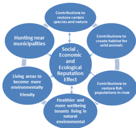
Fig. 3 Regenerative housing area design, SEERE-effect

The community housing company has the opportunity to contribute to municipality value in several ways. The public