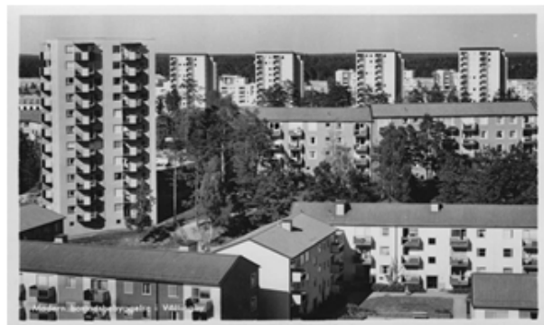
Fig. 1 Vallingby million program area, Stockholm

The “million program” was built in a period where the environmental considerations were low and ideas of man having the right to exploit nature. The architecture was inspired by the architect [1], a modernist who considered dwelling houses to be “machine habited”, machines to live in and meant that rationalism should be guiding every building and city construction project. Vallingby in Stockholm was one of the first million program areas: