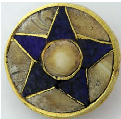
Fig. 4 The metal plate “five-point star”

The most unique finding of the mound is a plaque in the form of a five-pointed star. A five-pointed star depicts. Star is of very correct form, dark blue lapis lazuli stone is inserted in rays of the star (Fig.4). A round insertion of a horn is inserted in the center of the star. The background of the star comprises bone paste. Rays of the star are framed by a thin gold band. The back and edge-button plaque are wrapped in gold leaf. On the reverse side there is a gold loop, set in the middle of the plaque. The five-pointed star is very rare in the Saka-Scythian art. We are aware of only two cases of a five-pointed star image. One is in the earring from Olbia in the 6 th century BC, the other is from the Golden Hill near Simferopol, Uybat chaatas of Tashtyk era [8].