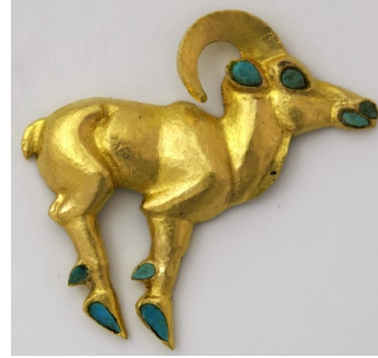
Fig. 5 The metal plate in the form of “argali”

In one instance the decoration in the form of argali of pure solid gold is presented (Fig. 5). It is the largest and most massive of all known clothing accessories. The eyes, ears, nostrils, mouth and hooves of argali are inlaid with turquoise. A young male argali is drawn there. The muscles of the neck, arm, jaw and grits are highlighted. Hooves are raised. The animal is depicted in a pose of preparing to pounce. The sculpture is very elegant; the proportions of the body are strictly complied with. On the reverse side there are two loops for sewing. Mountain sheep in the art of Saka and Scythians is quite common. He is known to us from Pazyryk, subjects of the Tagar time from Minusinsk Basin, in the North, Central Kazakhstan, in Arzhan [9].