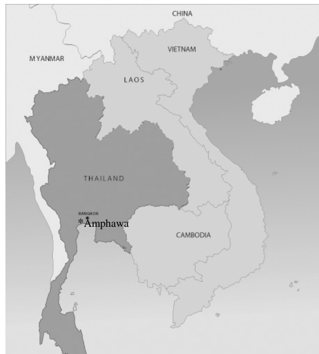
Fig. 1 Location of Amphawa, Samut Songkram

The mass tourists at Amphawa floating market can generate income to local people however tons of waste and wastewater have been generated by tourists, respectively. Light from the expansion of the municipal area, resorts, and tourism activities also affect mating behavior of fireflies. In addition, water consumption of tourists during weekend also creates water shortage in Amphawa.