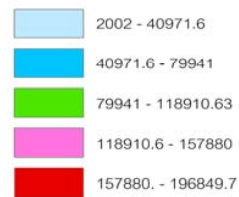
Fig. 2 Map of Water Consumption Demand of Tourist Accommodation in Amphawa

Range of Water Consumption Demand (Meters 3 /Month)