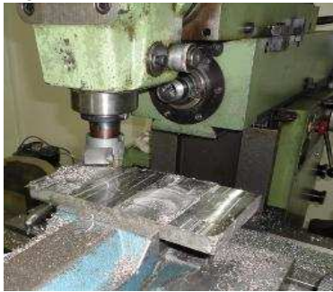
Fig. 1 actual machining operation

The experiments were performed in a Vertical milling machine (Tabriz co.) with a maximum spindle speed of 2500 rpm and 630 mm/min maximum feed rate. The machine had a 4.4 KW spindle motor. The actual machining operation is illustrated in Fig. 1.