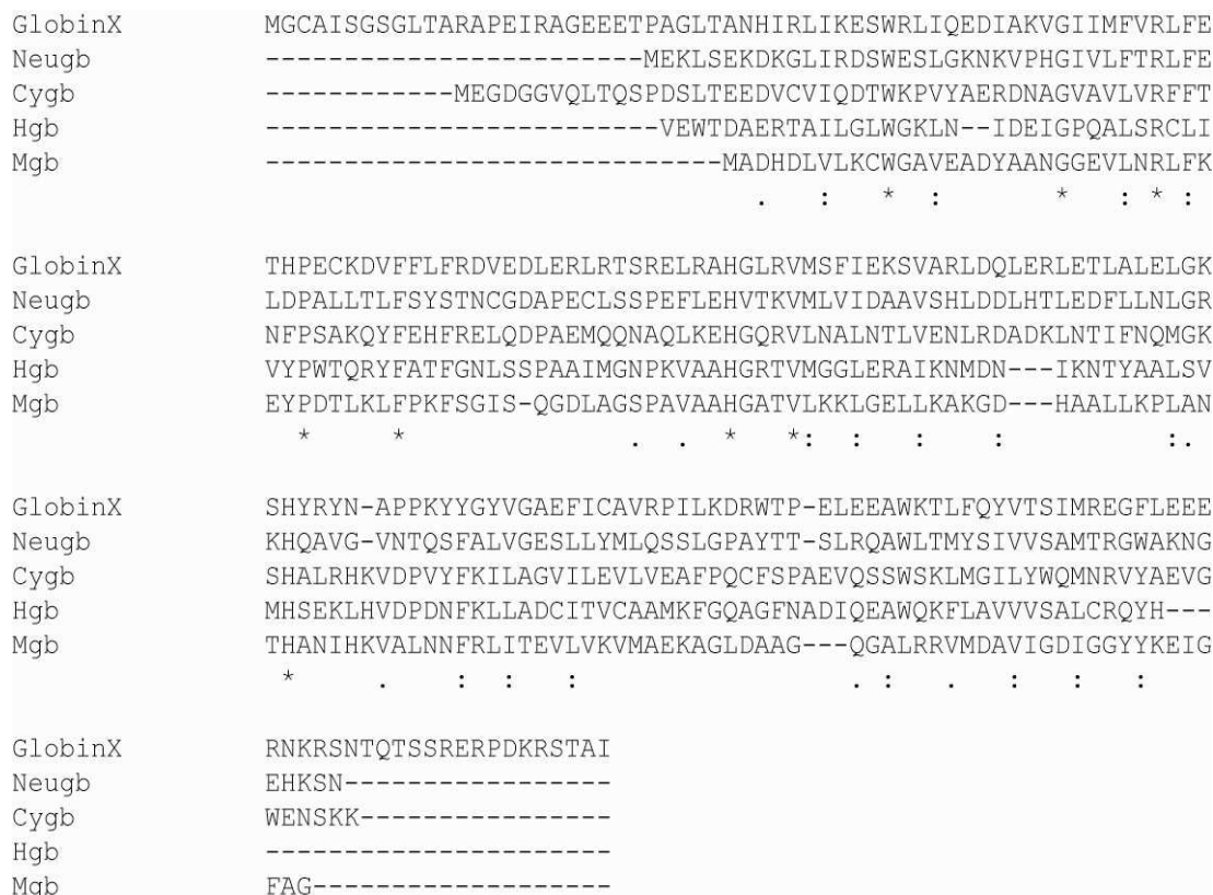
Fig. 1 Alignment of the amino acid sequences of the globin proteins from zebrafish Danio rerio . Identical residues, conservative replacements and semi-conservative ones are indicated by asterisks, semicolons, and dots, respectively. Neugb, Cygb, Hgb, and Mgb stand for neuroglobin, cytoglobin, hemoglobin, and myoglobin, respectively.