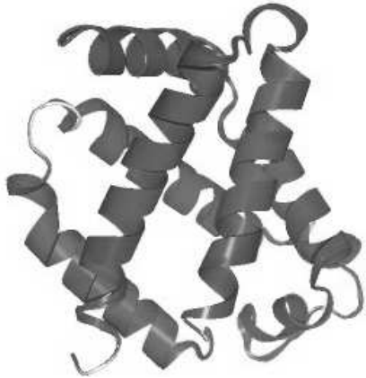
Fig. 8 Superimposed structures of neuroglobins from zebrafish (grey) and mouse (dark grey)

The structure of Neugb was used due to the fact that these two proteins were found to be closely related (Fig. 2). Despite the very low sequence identities among the globins (TABLE I) and a large variety of functions, their tertiary structures were found to be very similar. All of them gave typical globin folds consisting of eight helices. Roesner et al. [1] reported that the globin core of globin X is highly conserved based on the analysis on the substitution rates of amino acid residues in fish globins.