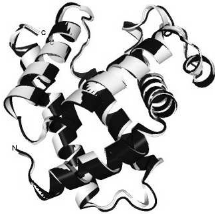
Fig. 7 Superimposed tertiary structures of cytoglobins 1 from zebrafish (grey) and human (black)