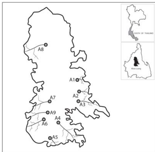
Fig. 1 Nine waterfalls at Khao Luang National Park. (A1-A9) represent waterfalls. A1: Ai-kaew; A2: Wangmaipak, A3: Promlok; A4:Kralom; A5: Thapae; A6: Suankun; A7: Huafa; A8: Suanhai; A9: Soidaw