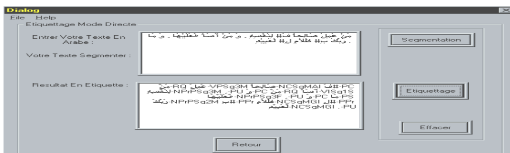
Fig. 3 Results after application of the Hybrid Method