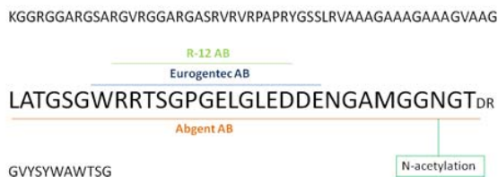
Fig. 1 Targeted Shadoo sequence of the analyzed anti-Shadoo antibodies

(AP4754b) against human Shadoo from Abgent Inc. The blocking peptide's sequence was available in the case of EG and AG antibodies. We could determine the sequence of the blocking peptide (sold by Santa Cruz) of R-12 antibody by mass spectrometry. Comparison of the known blocking peptide sequences are summarized on Figure 1.