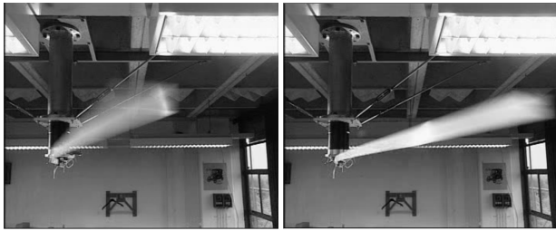
Fig. 2 An example of false cut detected by Dugad model, which was suppressed by proposed modification

The frames classified as cut according to graph in Fig. 1 are shown in Fig. 2. We can see it is not change of shots, there is only larger movement of object between two frames.