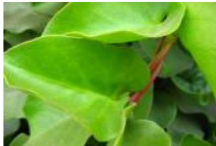
Fig.1. Leave of Binahong

Binahong plants located in Indonesia, China, Australia, Paraguay to southern Brazil, northern Argentina and the United States. Binahong Latin name is Anredera cordifolia (Ten.) Steenis, synonyms Boussingaultia cordifolia (Ten.) Boussingaultia gracilis, Boussingaultia Pseudobasselloides Haum [3], while the other equation is anredera country name, enredadera del mosquito (Spanish), filikafa , Gulf madeiravine , heartleaf madeiravine , Madeira vine (UK), lamb's tails , mignonette vine , Parra de Madeira (Spanish), tapau , 'uala hupe , teng san chi (China) [3,4]. This plant grows easily in the lowlands and highlands. Widely planted in pots as an ornamental and medicinal plants. Generative (seed), but more often developed or cultivated vegetatively through rhizome roots.