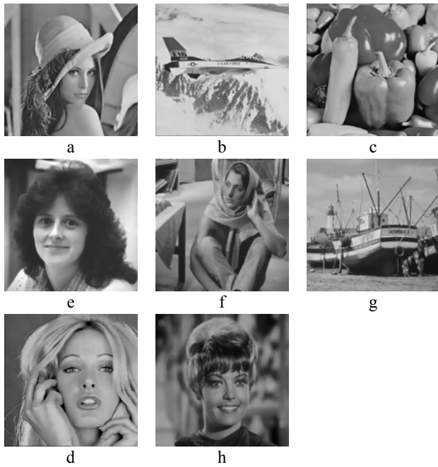
Fig. 3 Standard Images used for our experiment a) lena b) jet c) peppers d) Tiffany e) girl f) Barb g) boat h) Zelda