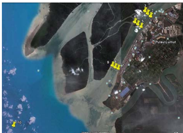
Fig.1 Location of the sampling stations in West Port Malaysia