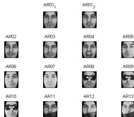
Fig. 2 Example of one individual from the AR face database: (1) neutral, (2) smile, (3) anger, (4) scream, (5) left light on, (6) right light on, (7) both lights on, (8) sunglasses, (9) sunglasses left/right light, (11) scarf, (12, 13) scarf left/right light

As in [11], we used as training images two neutral poses of each person captured in different days (labeled AR01 1 and AR01 2 ), while the testing set consists of pairs of images for the remaining 12 conditions, AR02...AR13, respectively. More specifically, images AR02, 03, and 04 are used for testing the performances of the analyzed techniques to deal with expression variation (smile, anger, and scream), images AR05, 06, and 07 are used for illumination variability, and the rest of the images are related to occlusion (eyeglasses and scarf), with variable illumination conditions.