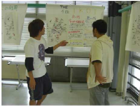
Fig. 5 The scene of their presentation