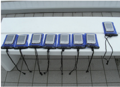
Fig. 1 PDAs used in our class