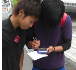
Fig. 3 Campus fieldwork Fig. 4 The scene of operating PDA