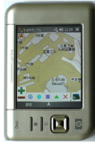
Fig. 2 Campus map