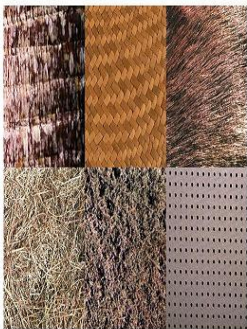
Fig. 1. Images of the VisTex database (left-right, up-down): Bark0, Fabric0, Fabric4, Grass1, Leaves12, Tile7