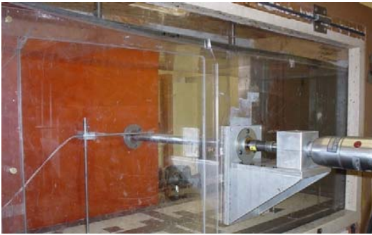
Fig. 1 A photograph showing the mechanical set-up

ratios, \lambda , between 0 and 2.7. Operating parameters for the HWA and PIV set-up and measurements can be found in [7].