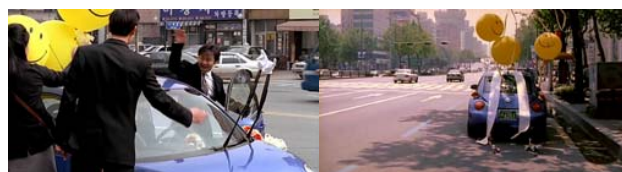
Fig 5 Jeongmin leaving for a honeymoon (left) and the rear of Jeongmin’s wedding car (right)

The friends decorate the bumper of the car for the honeymoon tour with tin cans connected by string or write messages on the car using a lipstick. These practices are also Western wedding culture announcing that they are newly married couple [11]. We can see such western traditions in Jeongmin’s wedding car.