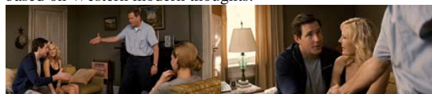
Fig 15 George meeting Tess' father (left) and George shaking hands with Tess' father (right)

Tess invites George home in order to introduce him to her father. A friendly mood is created as the father expresses his thanks to George and shakes hand with him for giving a job to Jane and marrying Tess. The two families meet each other on an equal position rather than on hierarchical human relation based on Western modern thoughts.