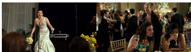
Fig 11 A friend appearing as a bride (left) and the divorced friend attending the wedding reception (right)

This is a case of Western wedding culture contrary to Eastern wedding culture based on Confucian thought that taboos divorce.