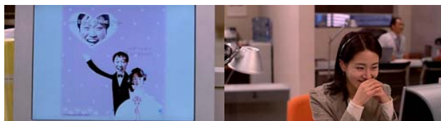
Fig. 2 E-invitation card sent by a male client (left) and Hyojin happy with the client's wedding (right)

after the meeting. The client invites using an email (e-invitation card) instead of sending a traditional invitation card according to Eastern proprieties. The simple and convenient invitation may be considered an example of remediation resulting from the mixture of invitation card, a traditional medium, and the advance of sociality, culturality and technology.